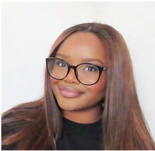
Jr. Creative Strategist, Roc Nation December